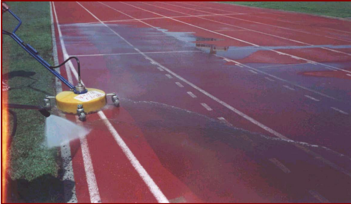
Washing of track to be done with rotary cleaning head & hand held pressure cleaner