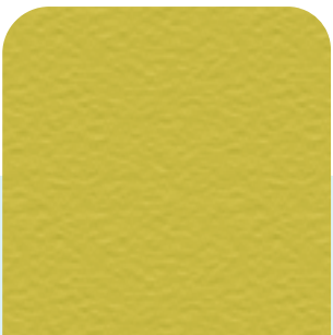
LAYKOLD KEY LIME